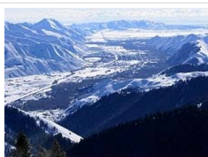
SunValley Idaho - fine dining in the mountains

Sun Valley has the distinction of being America's first destination ski resort. Its reputation as a glamorous playground for well-to-do skiers as well as hikers, bicyclists is rooted in its history, and the area still attracts the likes of Clint Eastwood, Arnold Schwarzenegger, Jamie Lee Curtis and Jean-Claude Van Damme as part-time residents. The area has also attracted a population of talented artists, resulting in a thriving performing arts and fine arts scene. And best of all, visitors and residents can enjoy incredible dining that's on par with large cities. The four hands-down absolute favorite restaurants: CK's and Vintage for dinner, Cristina's for breakfast and lunch, and The Pioneer Saloon -- the local steakhouse and bar, all four considered the very best in fine dining in Sun Valley by the members of Ultimate Escapes, a luxury destination club with residences in Sun Valley: